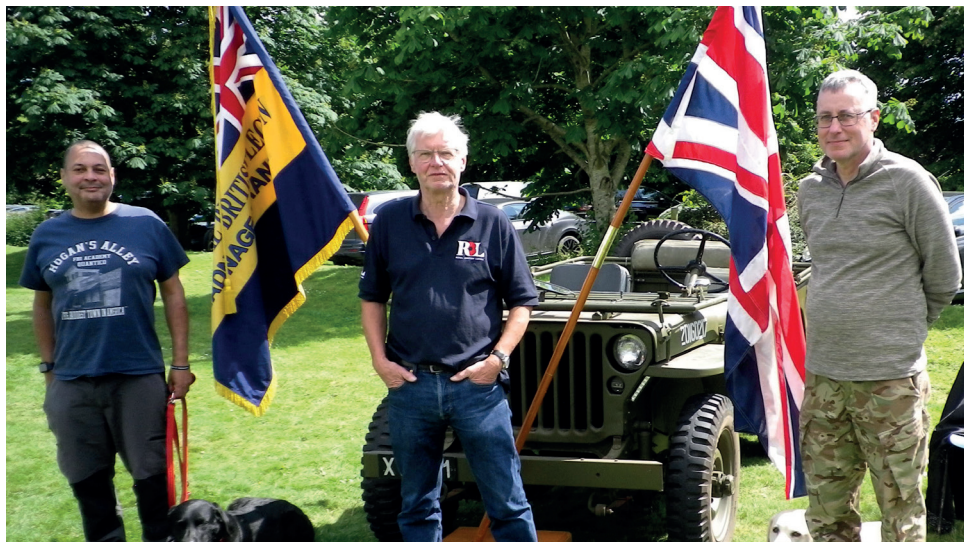
Radnage Parish Council

As a village we'd like to thank RPC for delivering another great village event on 8 th June. It was good to mark such a significant occasion in our nation's history. We really appreciate the work and effort you all put in to make it another great village event – Thank you from the residents of the best village ever!