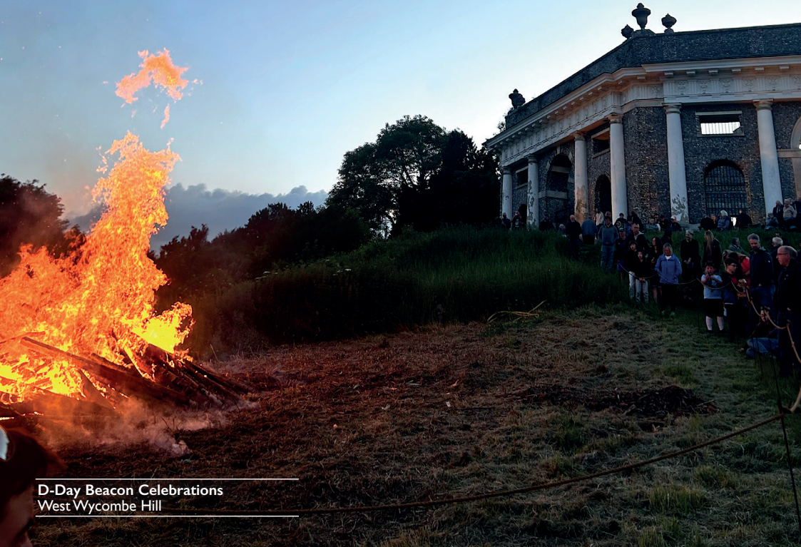
D-Day Beacon Celebrations West Wycombe Hill

BLEDLow RIDGE • BRADENHAM • PIDDINGTON • RADNAGE • WEST WYCOMBE