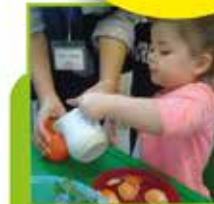
Self Help Skills Promoted