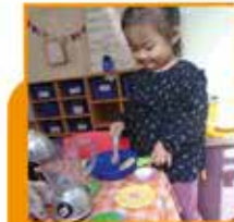
Strong Feedback from Schools