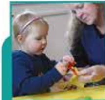
Supporting Child Development