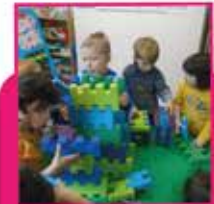
Many Returning Families